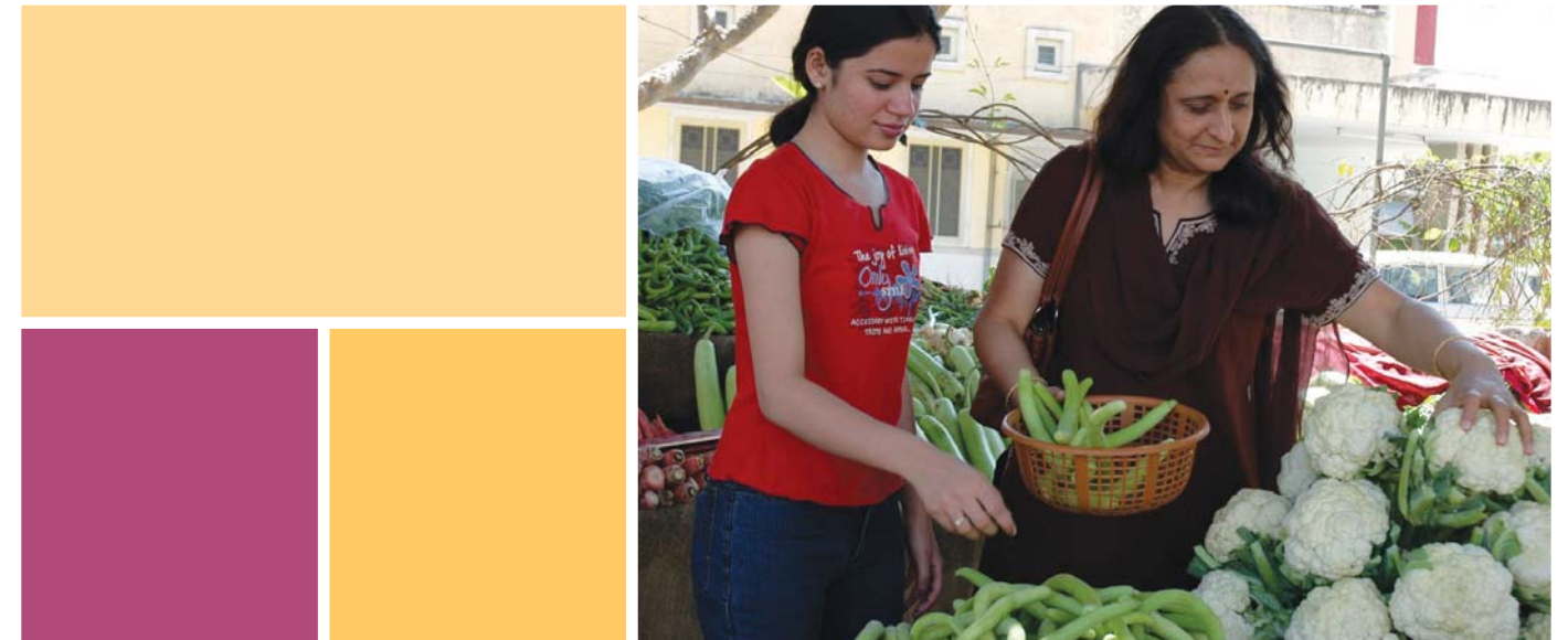
Creation of this material was made possible in part by a pioneering grant from CBCC-USA.

Eating well is a key part of good cancer treatment. But that is not always as easy as it sounds.